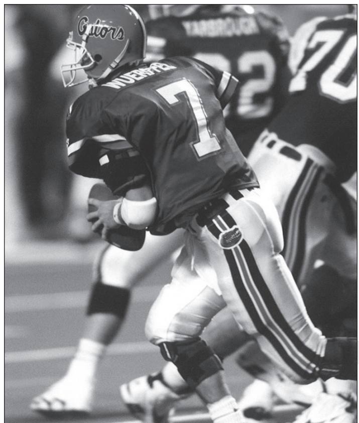
Behind Heisman Trophy-winning quarterback Danny Wuerffel, Florida's dynamic offense averaged 46.6 points per game in 1996 en route to the school's first national title.