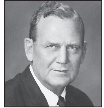
Paul "Bear" Bryant Kentucky/Alabama