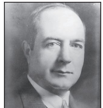
Dan McGugin Vanderbilt