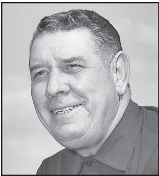
Ralph "Shug" Jordan Auburn