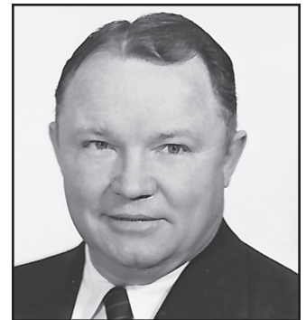
Wallace Butts Georgia