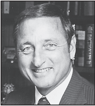
Vince Dooley Georgia