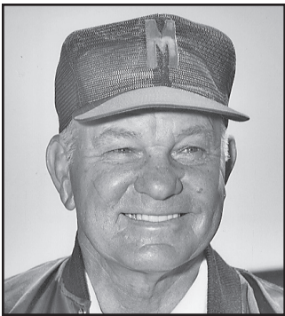
John Vaught Ole Miss