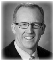
GREG SANKEY Commissioner