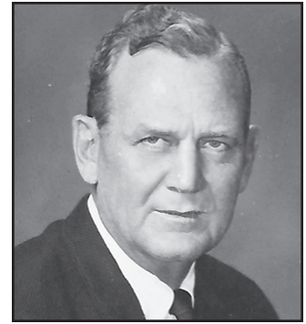
PAUL "BEAR" BRYANT KENTUCKY/ALABAMA

Minimum Five Years And .600 Winning Percentage; Active Coaches in Boldface