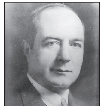
DAN MCGUGIN VANDERBILT