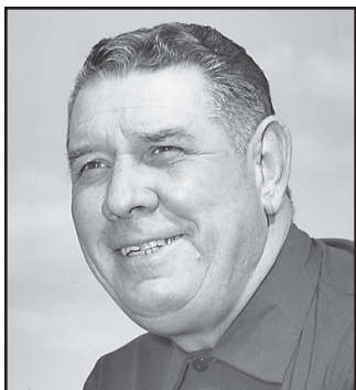
RALPH "SHUG" JORDAN AUBURN