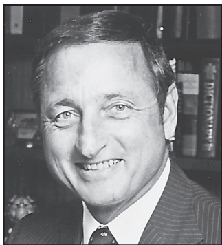
VINCE DOOLEY GEORGIA

Minimum Five Years And .500 Winning Percentage/Includes SEC Championship Games Active Coaches in Boldface