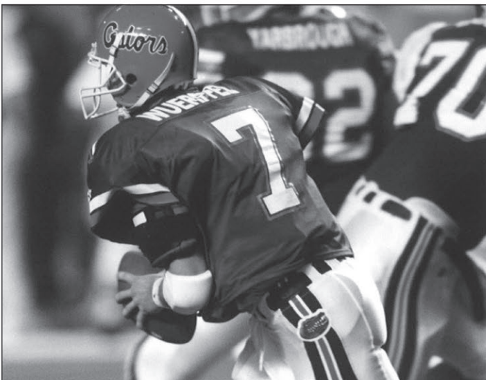
Behind Heisman Trophy-winning quarterback Danny Wuerffel, Florida's dynamic offense averaged 46.6 points per game in 1996 en route to the school's first national title.