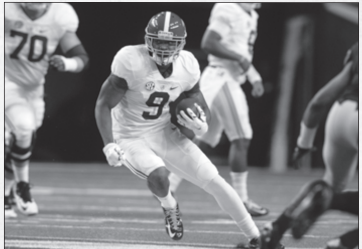
Alabama's Amari Cooper had 12 catches for 83 yards. His 12 catches broke the previous SEC Championship game record of 11 set by Florida's Reidel Anthony in 1995.