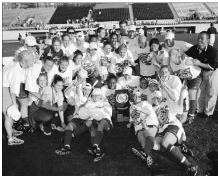
Florida celebrates after winning the 1998 NCAA Division I Women's Soccer College Cup, 1-0, over North Carolina.