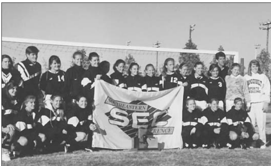
Vanderbilt won the first SEC soccer championship in 1993