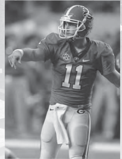
Aaron Murray moved past Tennessee's Peyton Manning into second place on the SEC's career touchdown passes list.