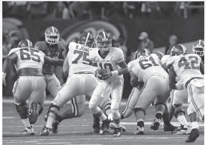
Alabama set a championship game record with 350 rushing yards in 2012.