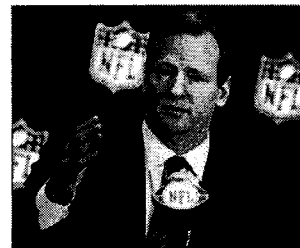
CAPTION

"I think it's a positive whenever you're negotiating, but clearly the litigation strategy that the union is pursuing is delaying some serious negotiations that really are going to lead to a collective bargaining agreement. That part of it is frustrating. I think valuable time is escaping us, that's putting financial risk and other risk in play. That's unfortunate for, most importantly, our fans, but also for our players and clubs."